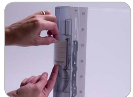
Easy to change label even when the binder is closed