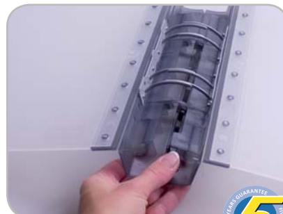
Five years guarantee