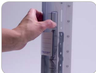
Easy to grip