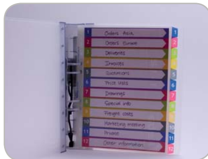
Extra wide cover (A4+)