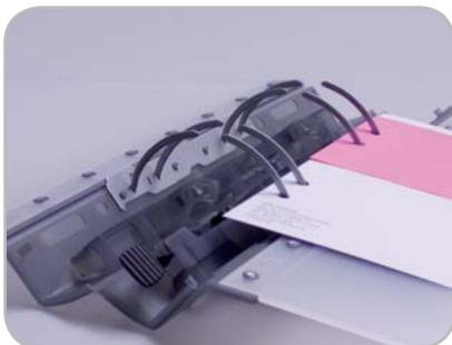
Double prong mechanism If you use plastic pockets, this is the best alternative

KEBAfrost A4+ Modern semitransparent colours. Smart split prong and extra wide covers.